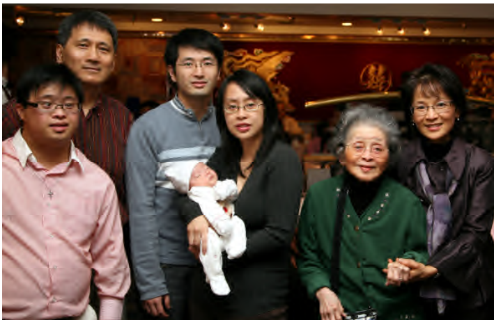
The Chan Family

services and was well known to our members. She was also a generous supporter of the Joy Living Society.