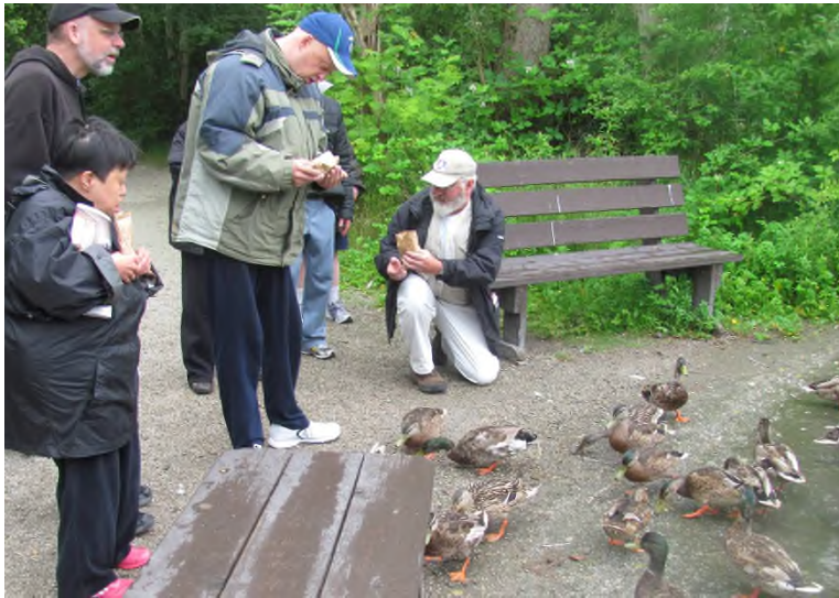
A day spent at the Reifel Bird Sanctuary learning about wildlife and water fowl.

After the closure of Woodlands, Joy Fellowship has held an annual summer picnic, inviting former residents to gather together. This year the reunion was held at Confederation Park in Burnaby.