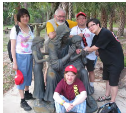
Holy Theme National Park in Orlando Florida