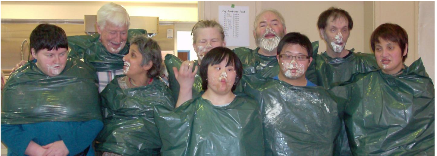
The Pie Eating Contestants

Many thanks to all of the volunteers who worked so hard at the Jamboree. Special thanks to the Youth Group from Burnaby Alliance Church who brought their musical group to play, while other of their members washed cars or helped with games.