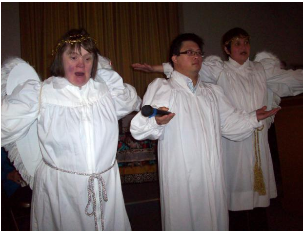
The Angels join with the Risen Christ as the congregation sings "Jesus Christ is Risen Today"